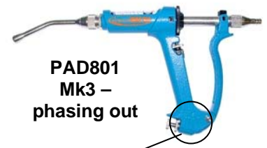
PAD801 Mk3 – phasing out

Minor Service Kit – WX1617 $15.90 GST Exc Major Service Kit – WX1618 $23.50 GST Exc Cylinder – SH1193A $11.70 GST Exc